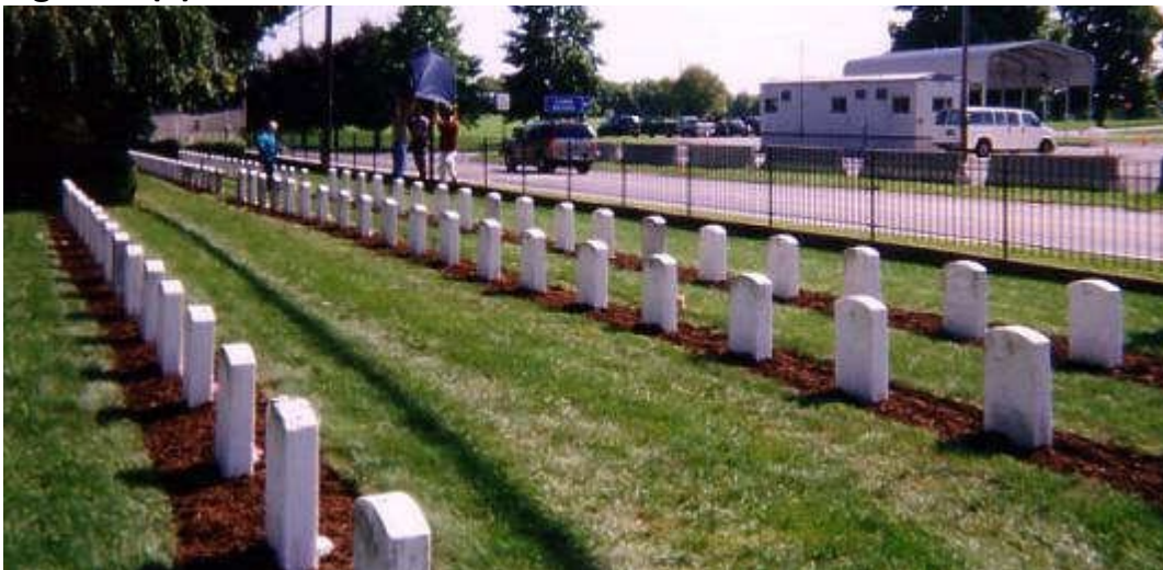
Figure 8 (a)