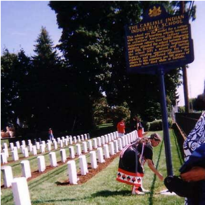
Figure 8 (c)