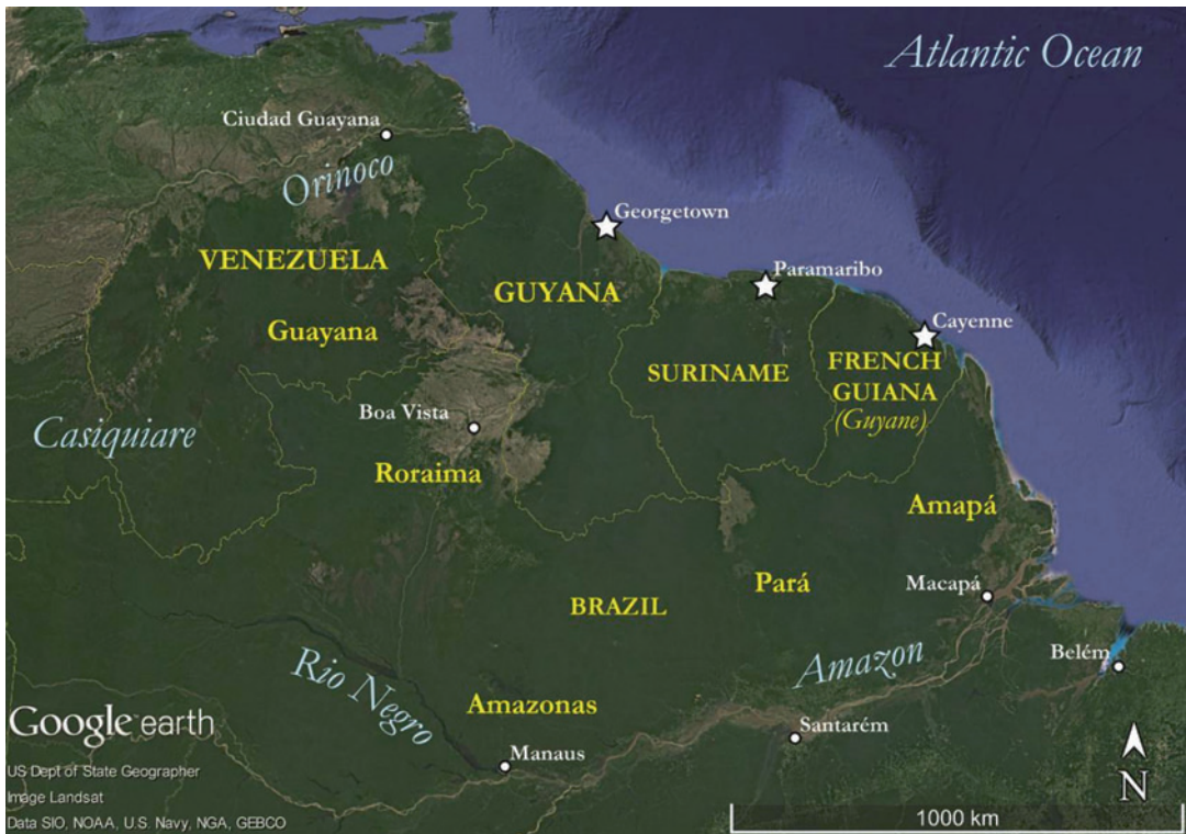
Archaeological Agenda in the Guianas, Fig. 1 Guiana (map by the author; source satellite image: Google Earth, August 27, 2016)

“The Guianas” refers to the three former colonies of, respectively, the United Kingdom (Guyana), the Netherlands (Suriname), and France (French Guiana or Guyane ). The Dutch used to have colonies or trading settlements in all five Guianas, yet their presence was most substantial in Guyana and Suriname. The colonies of Essequibo, Demerara, and Berbice (currently located in Guyana) used to be part of Dutch Guiana between 1667 and 1814. Guyana gained independence from the United Kingdom in 1966. Suriname became a constituent country within the Kingdom of the Netherlands in 1954 and gained independence in 1975. Today, French Guiana is an overseas department of France, and thus part of Europe. Venezuelan Guayana (Venezuela declared itself independent from the Spanish Crown in 1811) and the Brazilian territory east of the Rio Negro and north of the Amazon, i.e., the Brazilian states of Roraima and Amapá and the states of Pará and