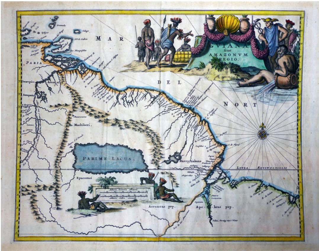
Archaeological Agenda in the Guianas, Fig. 2 Seventeenth century map of Guiana titled: Gviana sive Amazonvm regio (Guiana part of Amazonia) (John Ogilby 1671; hand colored copper engraving; private collection of the author)

thus impossible to define the archaeological agenda in the Guianas.