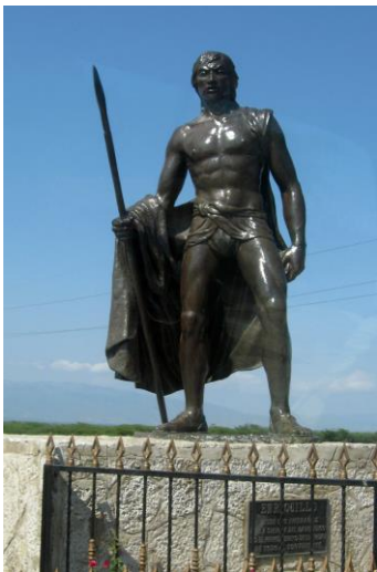
Statue of Enriquillo in Independencia Province, Dominican Republic.

Almost all of the standard histories claim that the last Taínos of Hispaniola were those who rebelled with Cacique Enriquillo from 1519-1534. In the first-ever treaty made between an Amerindian chief and a European king, Enriquillo and his people received their own village, Boyá, near Azua—a village that was attacked several years later by rebellious African slaves who burned down the village, killing off any inhabitants who did not flee.