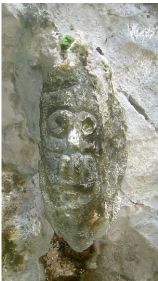
This is a Taíno cave guardian sculpture in today’s Los Haitises National Park. Images like these, frozen in stone, frozen in time, are the most vivid Taíno images in the minds of most people today.

As in other Latin American countries that were once Spanish colonies, the island’s indigenous peoples, the Taínos, are set upon a pedestal of the past—they are identified as frozen in a particular pre-Columbian and early Columbian time frame and highly admired as part of the island’s unique past. As in other Latin American countries, to be Indian in the present Dominican era means to be backward, rustic, gullible, or even feeble minded. Dominicans deny that Taínos survived the Spanish conquest, deny that they had the oh-so-human ability to change and adapt to new situations like the arrival of strangers.