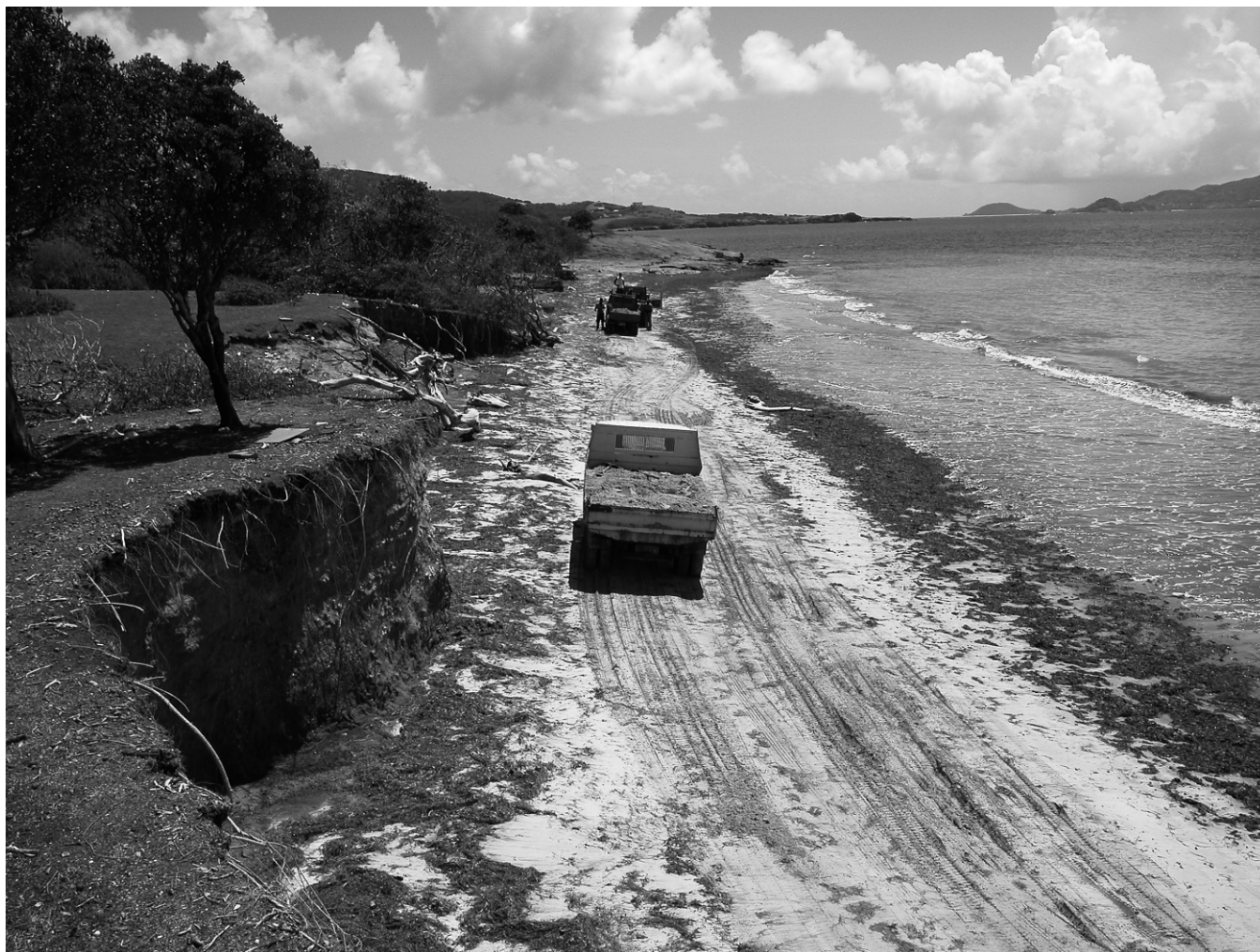
Figure 3 Locals mining sand at the Grand Bay prehistoric site on the island of Carriacou, southern Grenadines (east side, looking north). Based on detailed mapping and photographs taken at the site over the past six years, it is estimated that uncontrolled mining of sand here is leading to the erosion of at least 1 m of coastline per year and with it, hundreds of thousands of artefacts and other archaeological remains (Fitzpatrick et al. 2006). Note the exposed coastal profile at the left, the top half of which contains dense midden dating from ca. 1600–400 BP.

Historical ecological studies show how environments changed over time through the in-depth and comparative analyses of ecosystems using tools from a wide range of disciplines. As has been noted for the Caribbean (and recognised elsewhere in the world), islands and coastlines are integral pieces of the global puzzle that hold important clues for understanding the complex interrelationships between humans and other species. Unfortunately, as Edward Towle (from Nunn 2004, p. 311) noted, islands themselves have become an endangered species due to the unrelenting pressure applied by humans to adapt to and modify their environments through time.