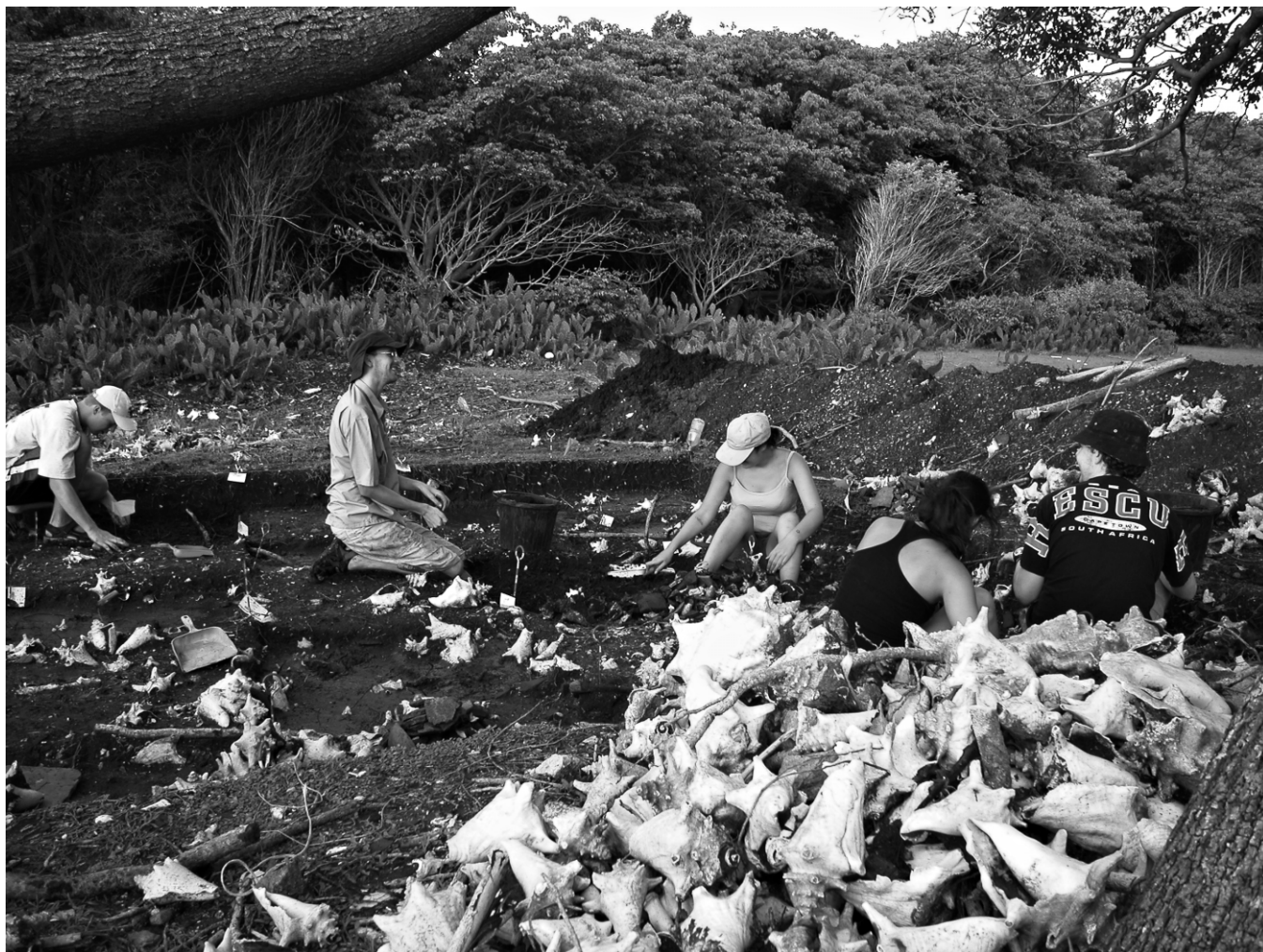
Figure 2 Strombus gigas was one of the most important resources in the Caribbean for food and producing tools such as adzes. They are common constituents of Ceramic Age sites as can be seen from this photo from the Grand Bay site on Carriacou (note shells in both foreground and in excavation unit).

changes in reef fish assemblages is an increase in pelagic fish such as tuna, jacks, and flying fish (Newsom & Wing 2004, pp. 111–112). The move from nearshore to offshore fisheries (an arguably riskier endeavour), may have resulted from the overpredation of reef taxa and also led to a heavier focus on horticulturally important food crops such as manioc to compensate for more widely available and easily accessible marine species. It is important to note that evidence from Anguilla suggests that not all prehistoric inhabitants of the Caribbean overharvested fish (Carder et al. 2007). With increased pressure to provide food to a growing population, land clearance for producing fuel and arable land would have also increased, and with it, erosion and infilling of local embayments and expansion of mangrove habitats.