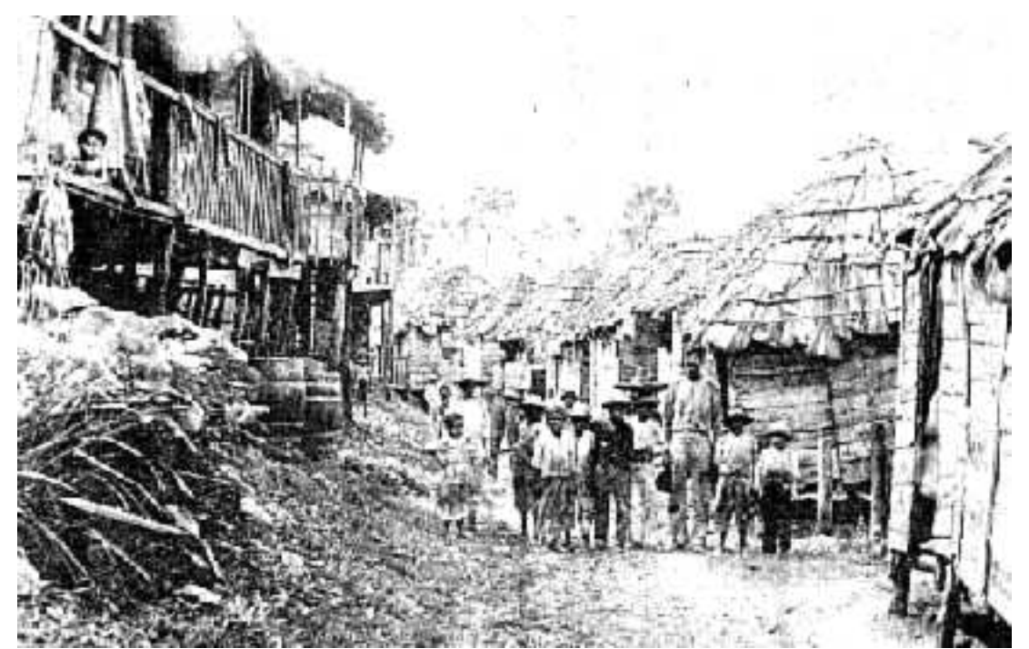
Poor "barrio" in Aguadilla Puerto Rico circa 1899. Poverty was interpreted as inferiority by the U.S. invading forces.