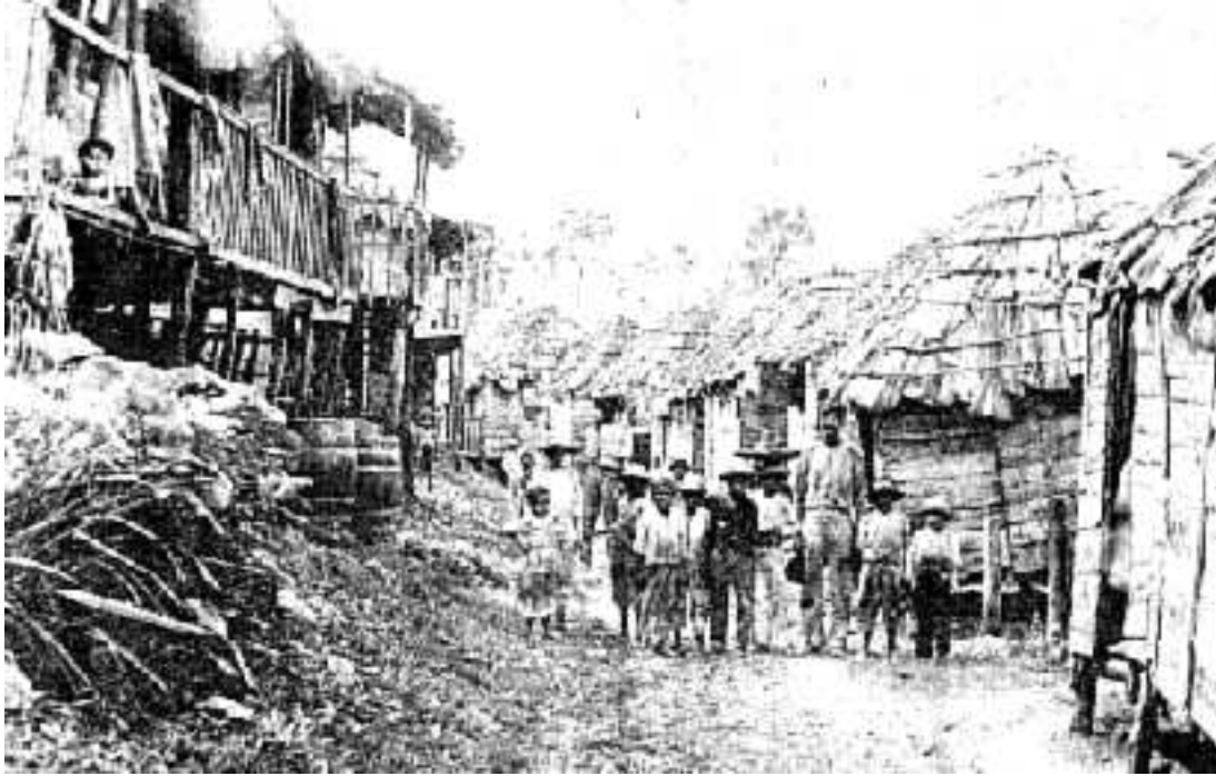
Poor “barrio” in Aguadilla Puerto Rico circa 1899. Poverty was interpreted as inferiority by the U.S. invading forces.