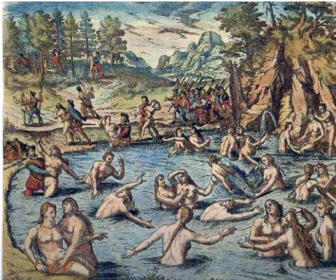
--Illustration, Histoire Naturelle des Indes: The Drake Manuscript in the Pierpont Morgan Library.

Can you imagine any sailors of any nation or era, after a month at sea, not taking advantage of a welcoming party that includes “naked” women with, apparently, none of the sexual prohibitions that were so integral a part of the lives of Catholic Spaniards at the end of the Middle Ages? Those were two of the first myths that arose about the Taínos, that they went naked and that they had no sexual prohibitions.