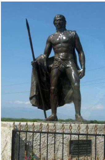
Statue of Enriquillo in Independencia Province, Dominican Republic.

Almost all of the standard histories claim that the last Taínos of Hispaniola were those who rebelled with Cacique Enriquillo from 1519-1534. In the first-ever treaty made between an Amerindian chief and a European king, Enriquillo and his people received their own village, Boyá, near Azua—a village that was attacked several years later by rebellious African slaves who burned down the village, killing off any inhabitants who did not flee.