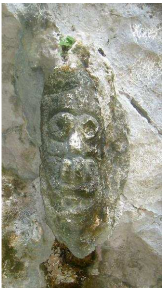
This is a Taíno cave guardian sculpture in today’s Los Haitises National Park. Images like these, frozen in stone, frozen in time, are the most vivid Taíno images in the minds of most people today.

As in other Latin American countries that were once Spanish colonies, the island’s indigenous peoples, the Taínos, are set upon a pedestal of the past—they are identified as frozen in a particular pre-Columbian and early Columbian time frame and highly admired as part of the island’s unique past. As in other Latin American countries, to be Indian in the present Dominican era means to be backward, rustic, gullible, or even feeble minded. Dominicans deny that Taínos survived the Spanish conquest, deny that they had the oh-so-human ability to change and adapt to new situations like the arrival of strangers.