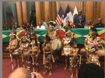
(Clockwise from top left) Baniwa boy; Wapichana Arawak boy; Wapichana

It is crucial to draw a distinction between the Taíno head dress, and the War Bonnet used by some North American Indigenous tribes. In these tribes, War Bonnets are worn only by males, and are created entirely of primary Golden Eagle feathers, that have been blessed, and gifted by the Chief or Medicine Man for acts of valor, or war deeds. These are not the head dresses of young men. The incredible power of these War Bonnets makes them deeply spiritual relics. Cacike Esteves says, “To wear such a head dress causes the hear to beat with the pride of the love, respect, and honor of the tribe.”