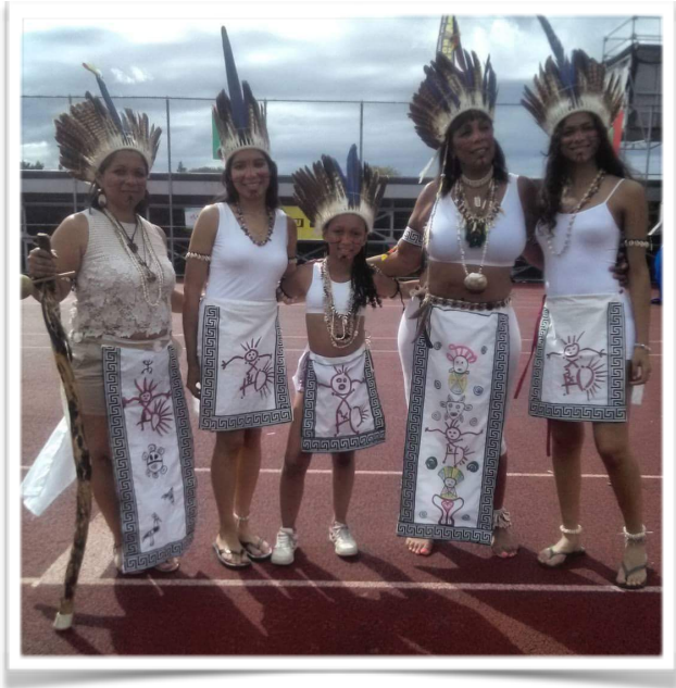
The Higuayagua Nitu Dancers

common symbolisms across the culture. For instance, the central tail feather, of a bird, is the most powerful feather, followed by the primary wing feathers, the secondary wing feathers, and the down feathers.