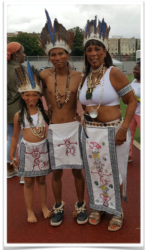
A Taíno family in their regalia